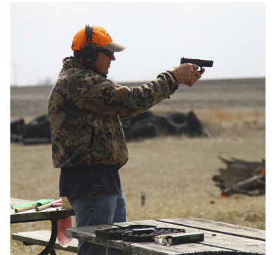
Sign Up Online hacamps.org Register now - spots fill quickly!