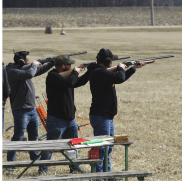
Per Person Fee $180 $150 The Inn Standard