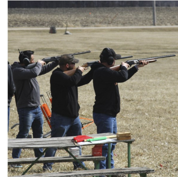
Per Person Fee $180 $150 The Inn Standard