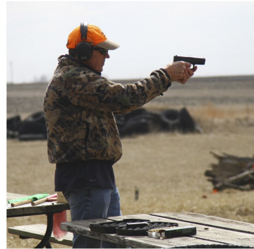
Sign Up Online hacamps.org Register now - spots fill quickly!